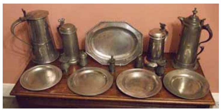
Flagons, plates, measures and spice pots of the 17th and 18th century

badge. By association with the saint it commemorated, it not only brought blessings on the pilgrim but also his family, animals and crops. Worn on hats, collars or on the chest these badges consisted of three types, those with stitch loops, those with integral cast pins and those in the form of pendants. Ampullae vessels to contain liquid, usually in the form of holy water from the shrine visited were worn about the neck.