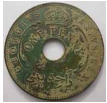
British W Africa Penny

It is unlikely that the truth will ever be known unless and until MI5 or MI6 release some more