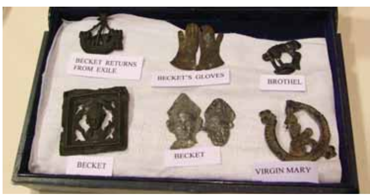
Tudor.

Pewter spoons over many centuries reveal a diversity of style and composition. Although the Company tried to regulate the quality of these wares many of