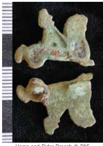
Horse and Rider Brooch

"The NCMD recognises that landowners hold a greater legal title to all non-Treasure items found by metal detection or other means on their land. In doing so, NCMD members need to