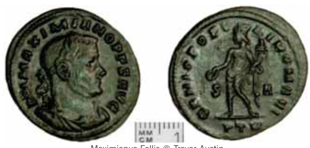
Maximianus.Follis © Trevor Austin

should be considered in discussions with landowners.