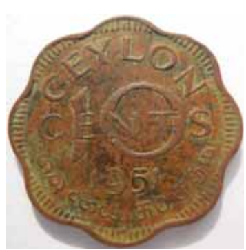
Cylon 10 Cents