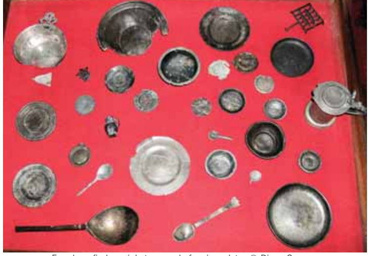
Foreshore finds mainly toys, and of various dates

In 1348 the Pewterers' craft of London specified the use of fine metal (tin with copper) and lay metal (tin with lead) – the latter alloy was much used throughout Europe. Flatware (dishes, plates,