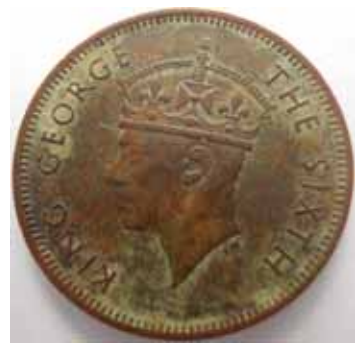
Hong Long 10 Cents