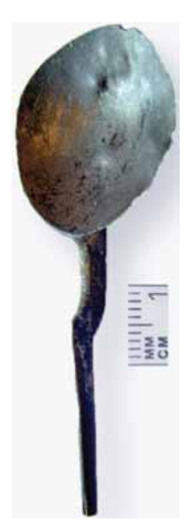
Roman Cochlear spoon 1st-2nd Century

Finds Liaison Officer -Buckinghamshire Bucks County Museum Resource Centre, Tring Road, Halton, Buckinghamshire. HP22 5PN Work T: 01296 624519 rtyrrell@buckscc.gov.ukVcardFOAF