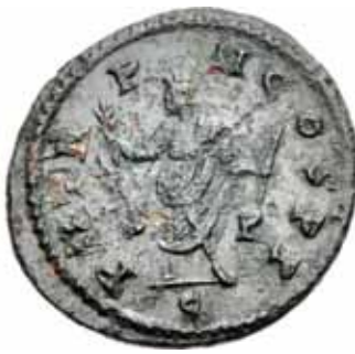
A unique Coin of Allectus.