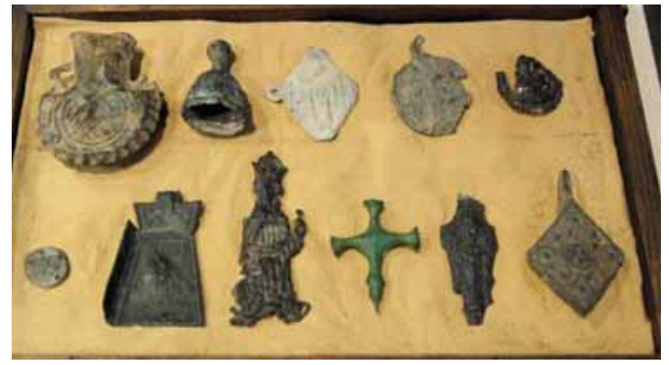
Tudor.