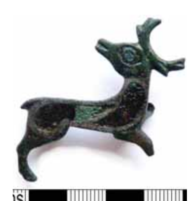
Roman Stag Brooch