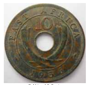
E Africa 10 Cents

information. We can thus only guess whether the foreign coins were part of an elaborate smokescreen.