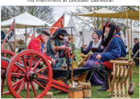
A group of appropriately attired visitors drink to the King at Bosworth battle field.