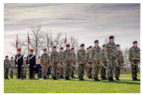
An escort of army cadets with the coffin bearing carriage

They argued that York would be a more appropriate city for his internment, especially since he might have been intending York Minster to be his mausoleum, and that failures to take into account relatives' wishes or the king's own preferences was a breach of human rights. However, the judicial review eventually put an end to the dispute