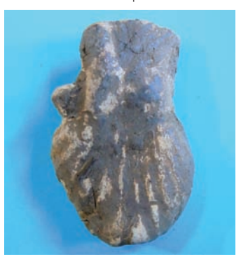
She also found a fine example of a pilgrim's ampulla