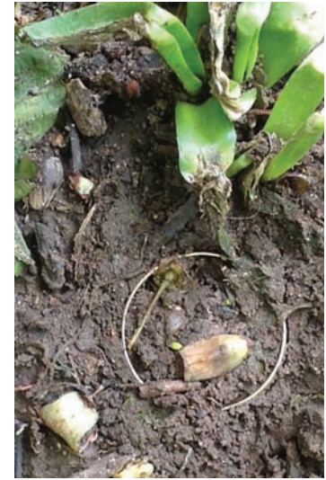
The ring as it was found in the ground

The free search and recovery service is offered by many clubs and as well as being a good PR exercise for metal detecting generally it also goes a long way to help secure new farm land. In the