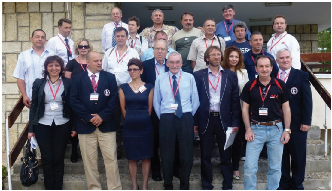
The participants in the round table on the subject 'Cultural heritage, collecting and metal detecting in Bulgaria – key problems and legal aspects', May 23, 2013, Lovech, Bulgaria

The national legislation in Italy and the so called law: Code of Cultural Objects provides for a possibility for the Ministry to grant concessions for the implementation of research requiring metal detecting devices to