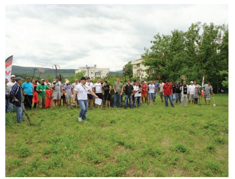
The Fifth National Festival for metal detecting, May 24-26, 2013, Lovech, Bulgaria