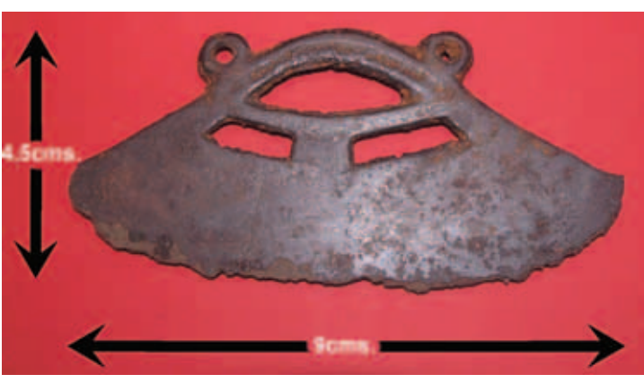
Bronze double-loop razor. This razor was found near Milnthorpe, Cumbria on pasture land. It dates from the very end of the Bronze Age to the beginning of the Iron Age, often referred to as the Hallstatt C period. (700 BC)

for lunch and the drawing of the raffle we trudged our way back to base. During our break we mulled over where to try next and settled for the two fields at the bottom of the hill again, this time taking the car to save us another climb (clever stuff or what!). Anyway we carried on where we left off, finding more Georgian and Vicky coins, two nice buckles and other items of no interest whatsoever to anyone except crazy metal detectorists'. Going into the second field, which was smaller with a dyke running along one side, things were very much the same. It was now getting cold with not much detecting time left, and working my way back towards the